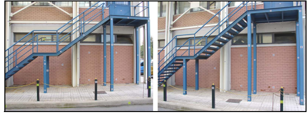
Figure 1. A typical stereo pair of the first image group.

sions for different purposes (Figure 1 shows a typical pair). In all cases, ground control was at hand (signalled in three cases, detail points in the fourth). This allowed to weaken the effect of noisy measurements of homologue points, but also to assess the actual accuracy of reconstruction. As illustrated at the example of Figure 2, object points were well-distributed in 3D (not close to planarity); referring to Table 1, z shows the mean ratio of the maximum difference in depth to the imaging distance.