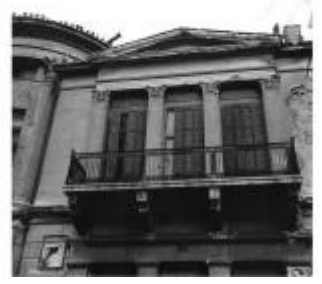
Figure 2. The five images of the 'Tsopotos' residence.

The program solves the bundle without control ('relative solution'); it offers options for both full and partial self-calibration (camera constant, principal point and/or radial lens distortion); it may handle control coordinates as observations; further, it can accept any of the three geodetic coordinates of control points as known and the others as unknowns, a very useful feature in the context of architectural photogrammetry (see 4.2). For both programs the same 92 tie points were used, but image coordinates were measured independently within the two environments. An average of 3.7 intersecting rays per object point formed a strong bundle configuration. The image at the bottom of Fig. 2 has a larger scale. Adjustments for all 5 images but also for the remaining 4 have been carried out to check for any possible differences due to this particular image (Rova, 2003).