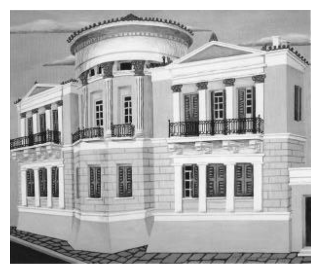
Figure 1. The 'Tsopotos' residence painted by the distinguished poet and painter N. Egonopoulos (Egonopoulos, 2001).

Built in 1870 by an unknown architect, the 'Tsopotos' residence was, until its demolition, a characteristic Athenian house, partly imitating a particular ancient Greek monument (Fig. 1).